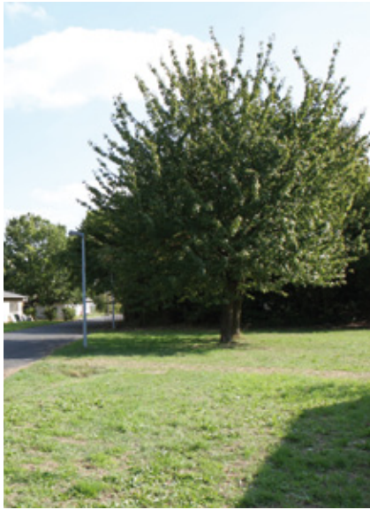
Schwalbach am Taunus 40,000 m 2 grounds