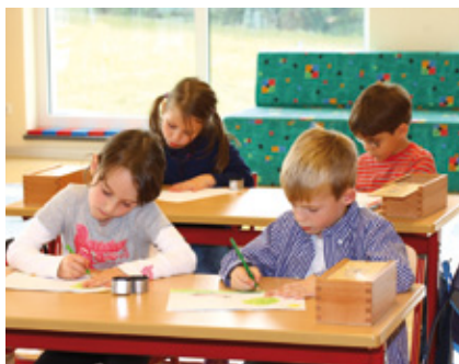
The timetable allows effective learning organisation

Extra-curricular activities start after 3 p.m. Some of the activities offered are: games, handicrafts, sports, music and computer studies.