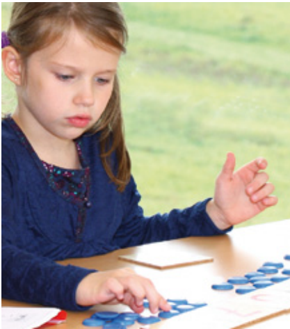
Maths is fun!