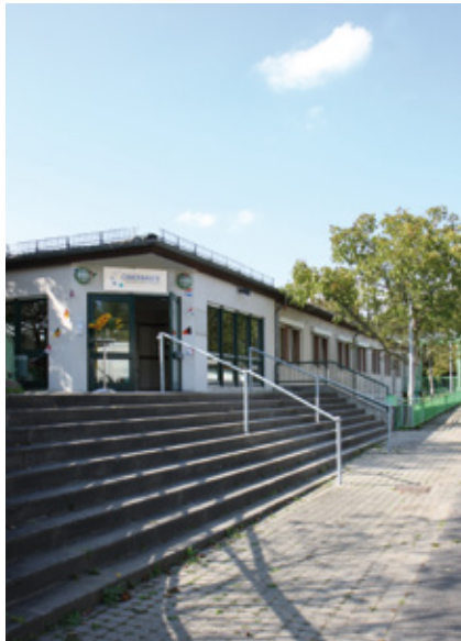
Entrance International School